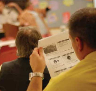
Members take away a better understanding of issues impacting K-12 education.