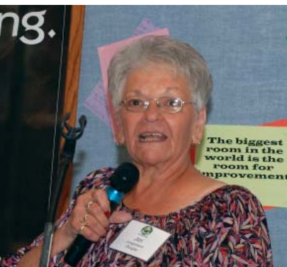
Region Directors interact with the members they represent.