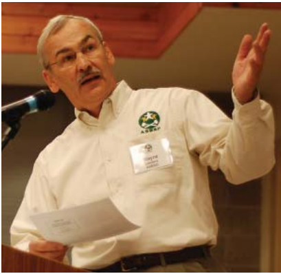
ASBSD staff offer timely and informative presentations.